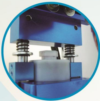
▲ Patented Ink-Scraping Structure